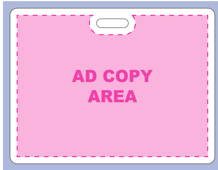
NPSG-30: front & back

Please remove all guideline indicators before submitting artwork